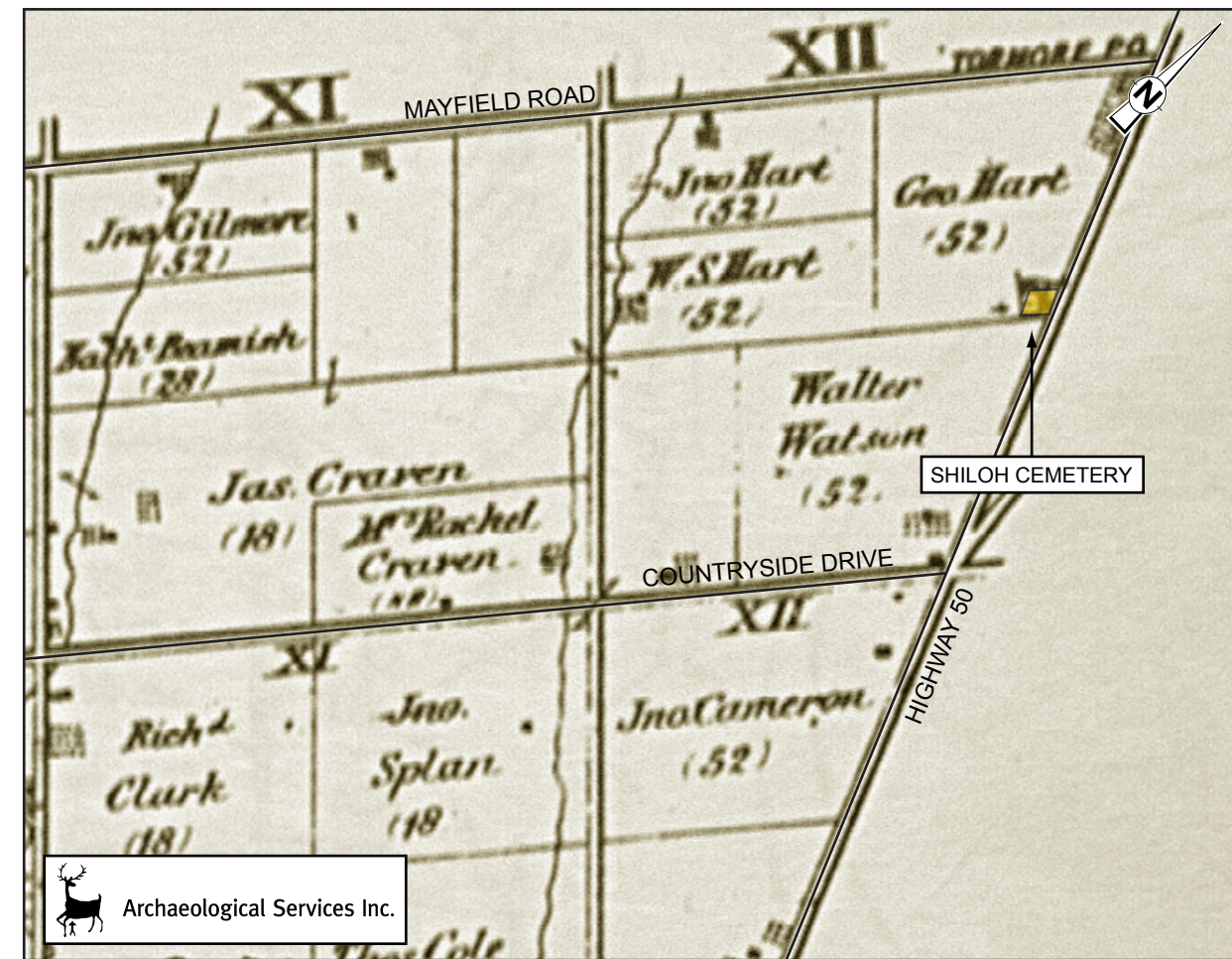
Figure 3: Location of Shiloh Cemetery on the 1877 map of the Township of Toronto Gore Base Map: Illustrated Historical Atlas of Peel County (1877)