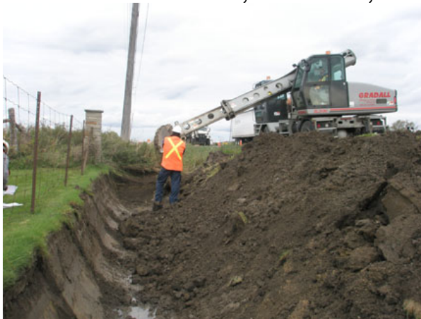
Plate 3: North-northwest view of trench and profile of west wall. All soil is sterile with no evidence of burials in ROW.