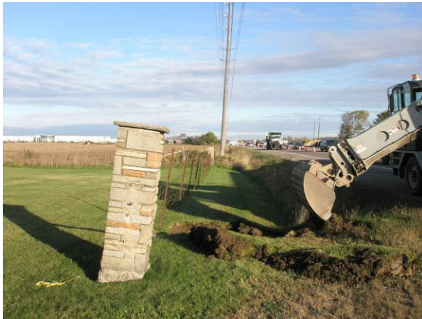
Plate 1: North-northwest view of the study area. Gradall trenching in progress. Note the stone posts that mark the eastern boundary of the cemetery.