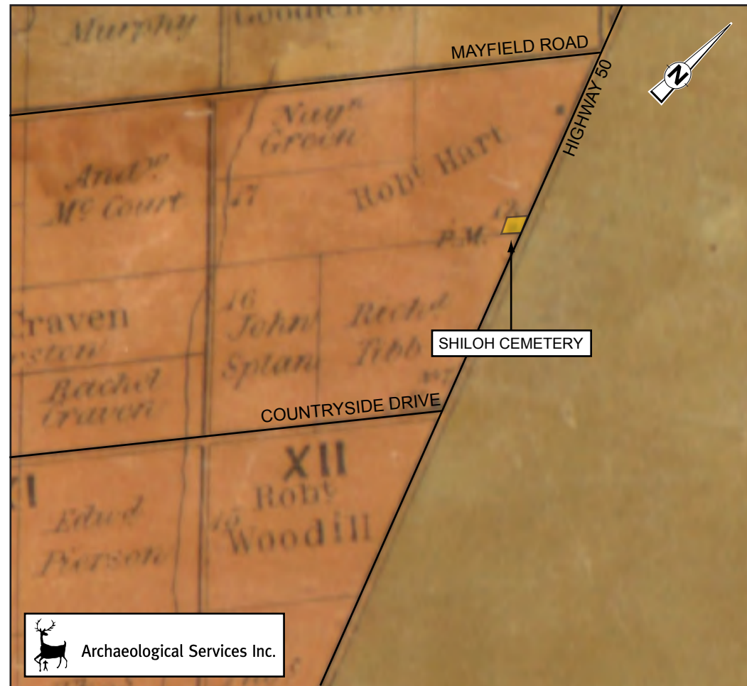
Figure 2: Location of Shiloh Cemetery on the 1859 map of the Township of Toronto Gore Base Map: Tremaine's Map of the County of Peel (1859)