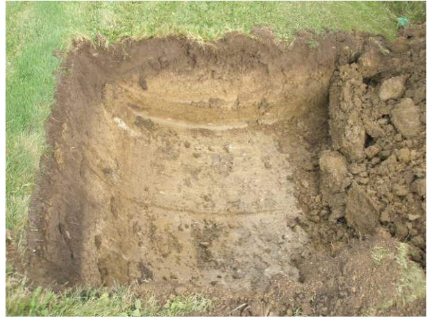
Plate 2: West view of sterile soil in trench wall. Clayey-loam topsoil and orangey brown subsoil.